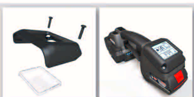
User interface cover for additional protection in harshest environment