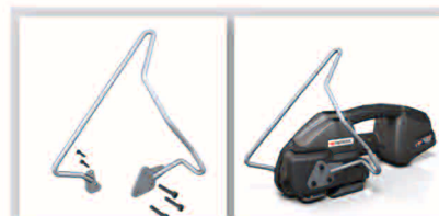
Suspension bow for stationary applications