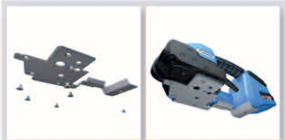
Protection plate for usage on abrasive surfaces