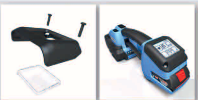
User interface cover for additional protection in harshest environment